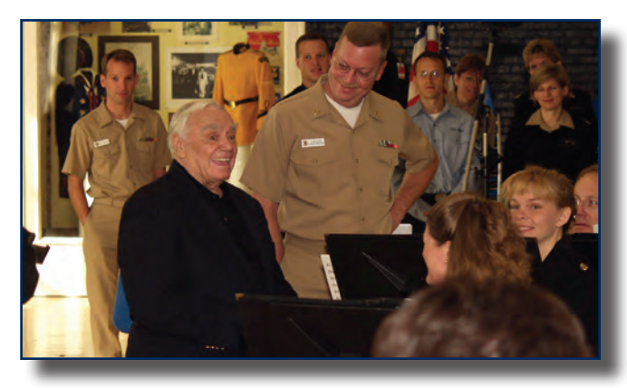
(Oct. 18, 2002) Ernest Borgnine rehearses with the Navy Band in preparation for the concert celebrating the Navy's birthday at DAR Constitution Hall in Washington, D.C.