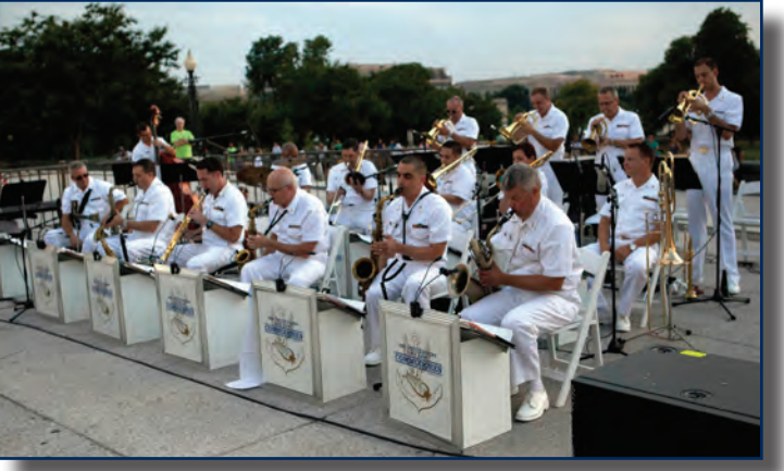
The U.S. Navy Band Commodores jazz ensemble performs on the west steps of the U.S. Capitol in Washington, D.C.