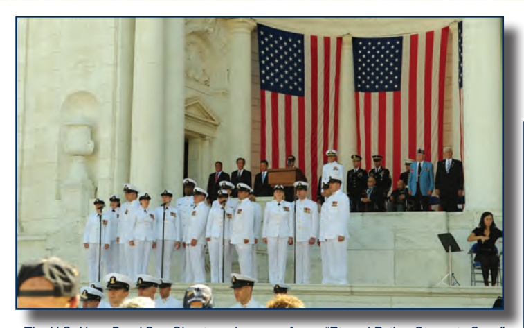
The U.S. Navy Band Sea Chanters chorus performs "Eternal Father Strong to Save" during the commemoration of the 59th anniversary of the Korean War armistice at the Arlington National Cemetery Amphitheater in Arlington, Va. The commemoration ceremony followed a wreath-laying ceremony at the Tomb of the Unknowns recognizing veterans of the Korean War. The ceremony was part of the three year commemoration of the Korean War which began on June 24, 1950, and ended on July 27, 1953, with the signing of the armistice.