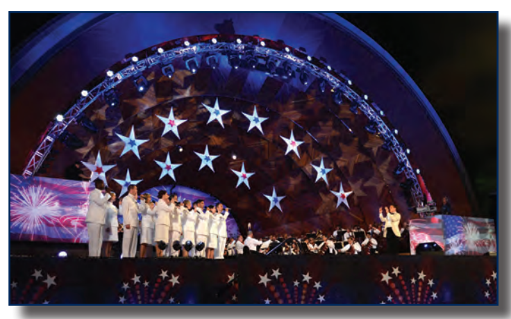
The U.S. Navy Band Sea Chanters chorus perform with the Boston Pops at the Hatch Shell on the Esplanade in Boston. This celebration was one of 15 signature events planned across America in 2012. The eight-day long event commemorated the bicentennial of the War of 1812, hosting service members from the U.S. Navy, Marine Corps and Coast Guard and coalition ships from around the world.